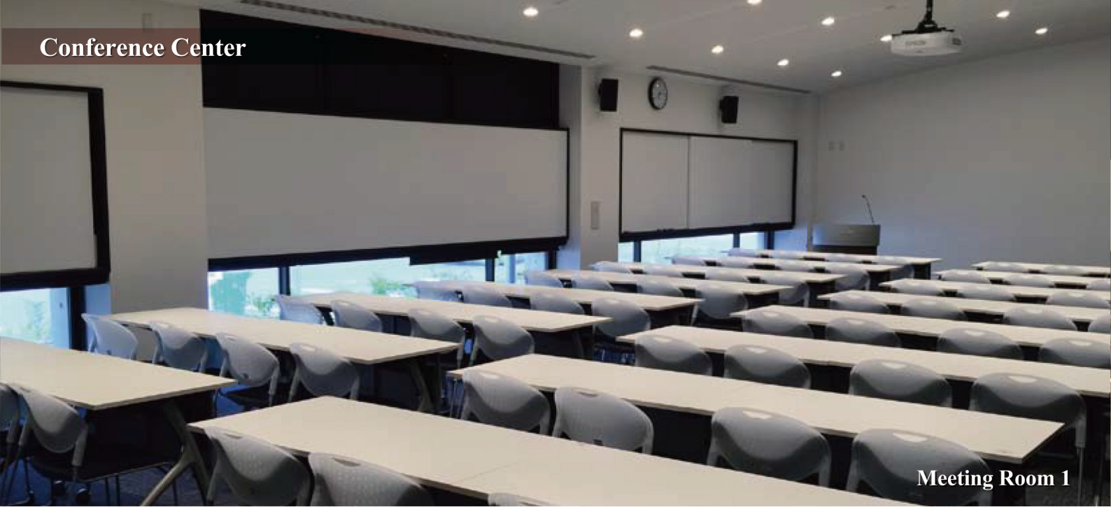
Meeting Room 1