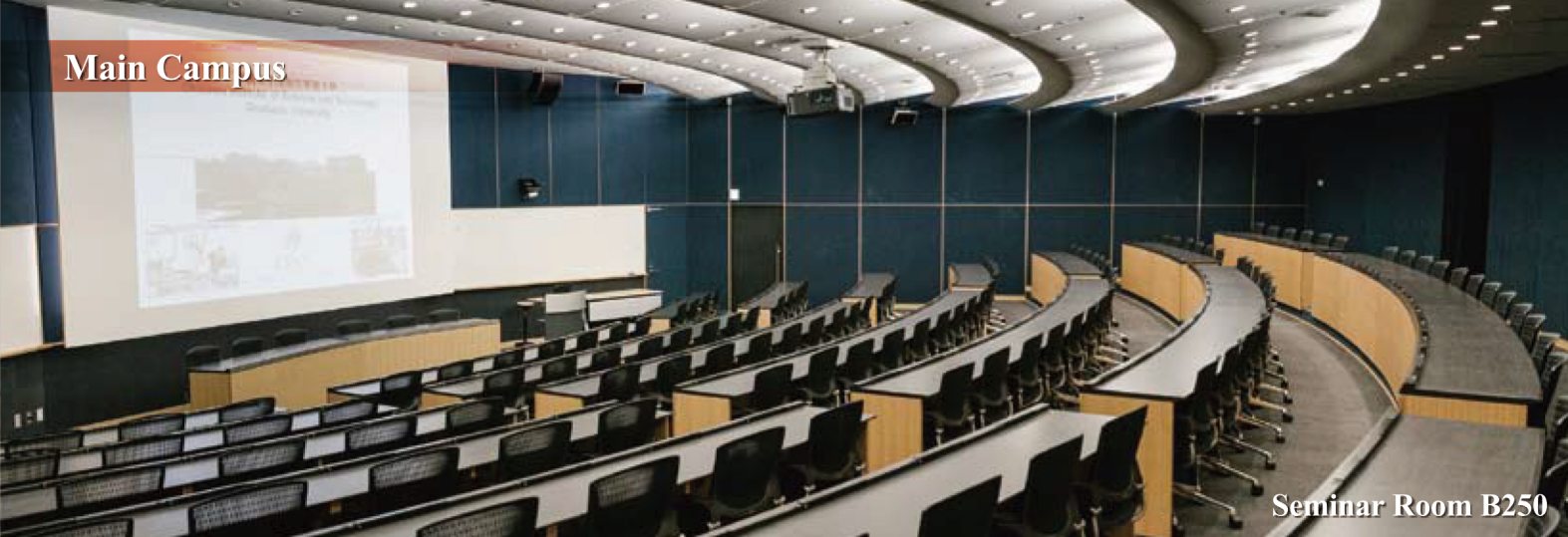
Seminar Room B250