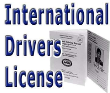
Valid International Driver's License