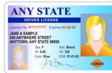
Original Driver's License