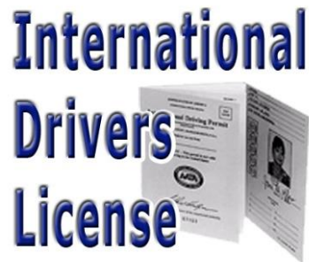
Valid International Driver's License