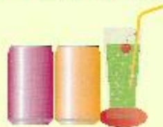
Chu-hi=350ml 1 Unit

1 Unit of Awamori = 100ml at 25% alcohol content