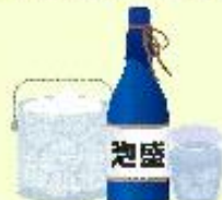
Awamori=100ml 1 Unit