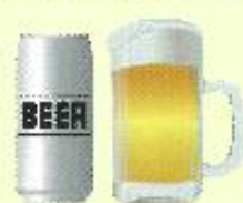
Beer=500ml 1 Unit