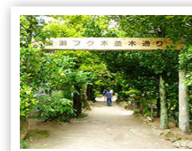
Fukugi tree road

Registration: at workshop venue with excursion fee(cash only), until Sat. 29 June