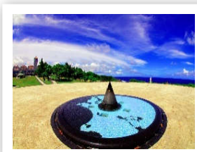
Peace Memorial Park