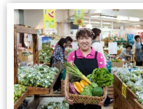
Yambaru local Market