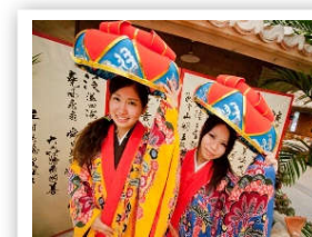
Traditional Okinawa village