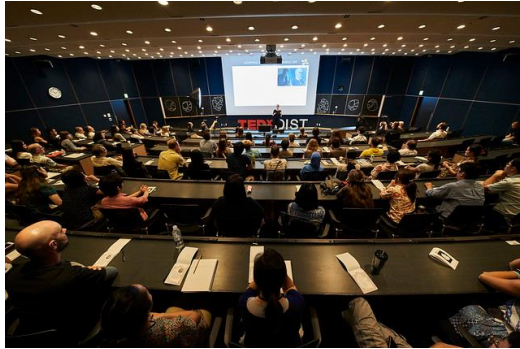
1. Conference and Workshop Travel