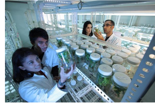
2. Educational Institution Visit (Simple round trip airfare only)