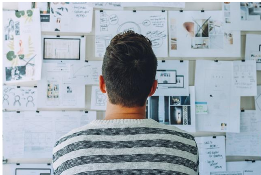
3. Career Development Travel (Domestic only for students in 3 year and up)