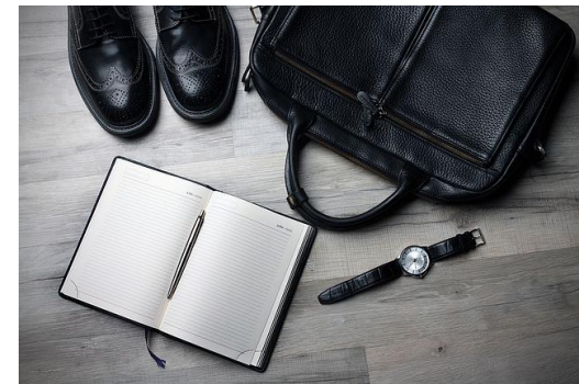
4. Business Travel supported funded by supervisor

#1~3 are funded by Graduate School once/academic year